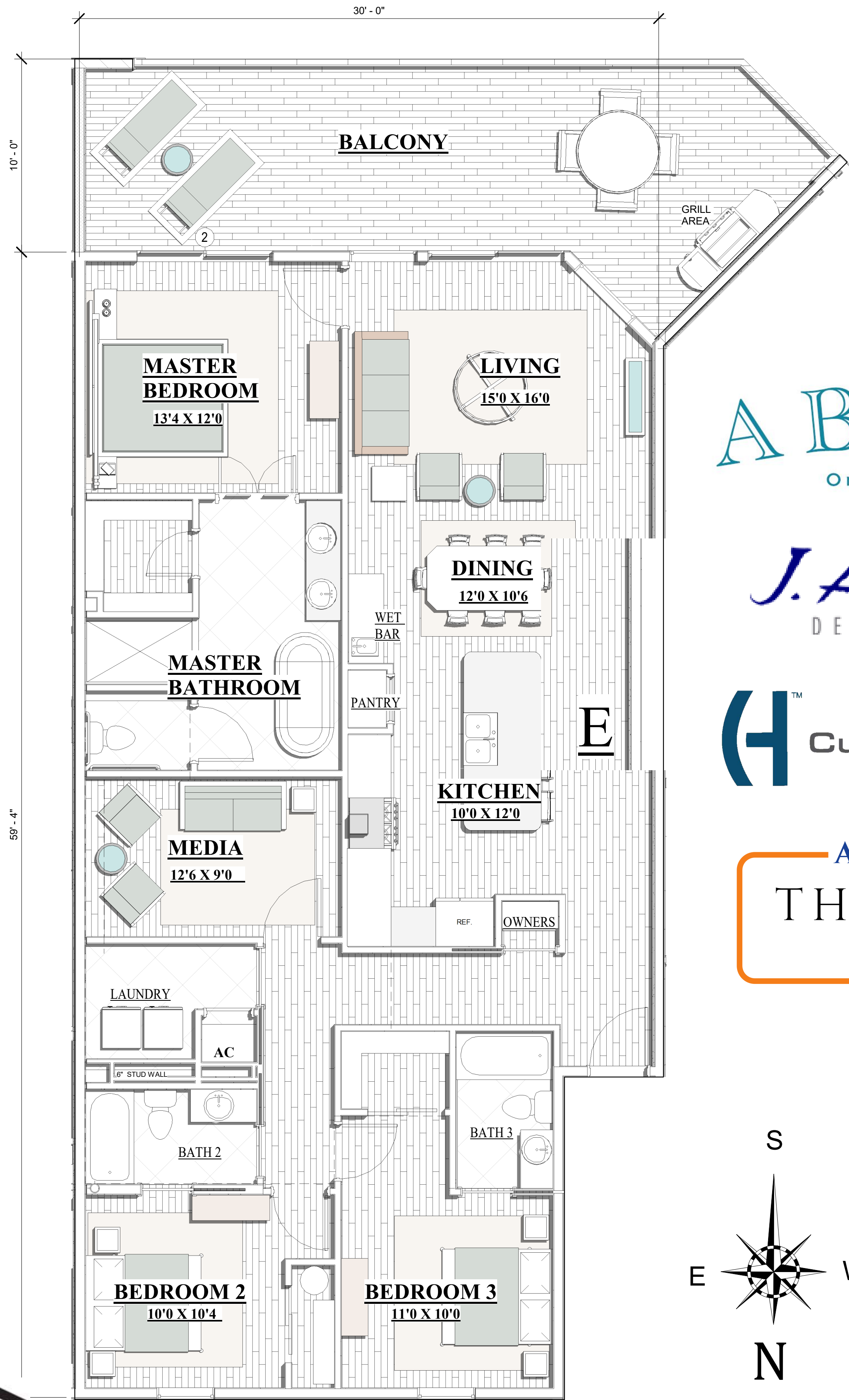
UNIT E FLOOR PLAN

1,575 SF 375 SF BALCONY 3 BEDROOM W/ MEDIA 3 BATH