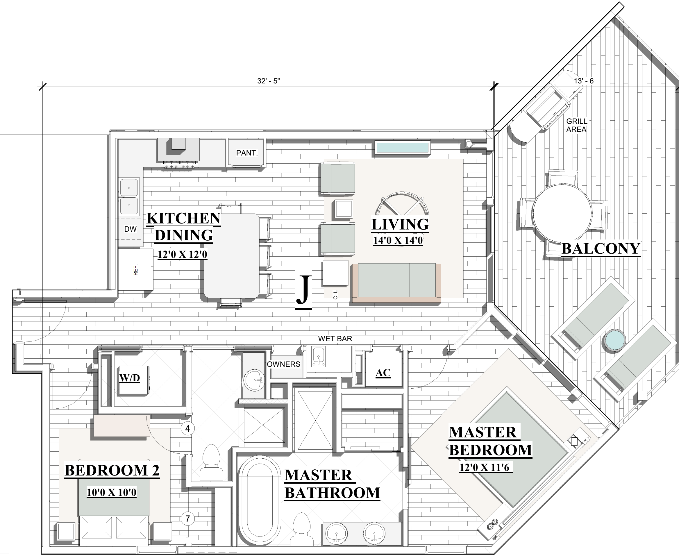
UNIT J FLOOR PLAN